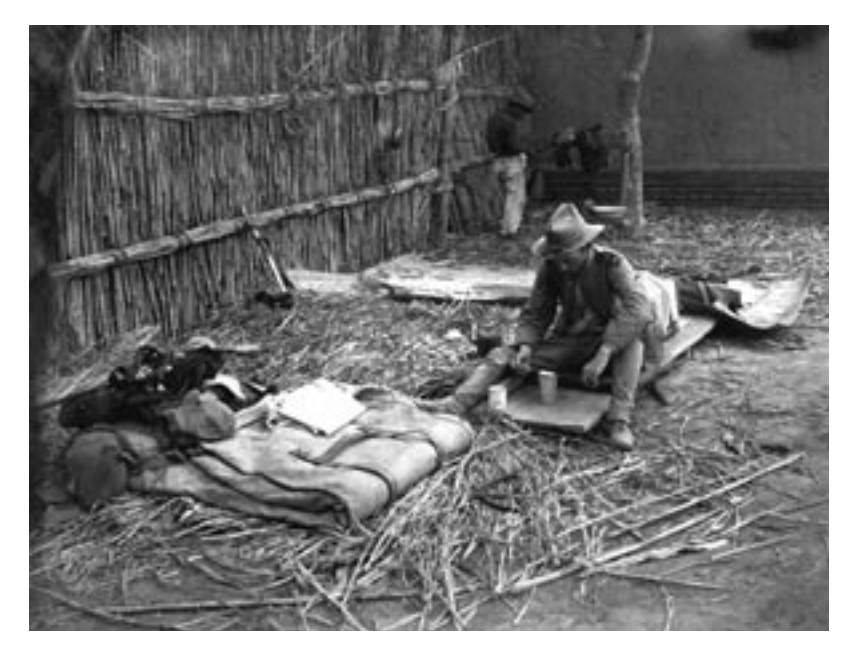
Typical Officer's Sleeping Quarters in China, ca. 1900

Although the McKinley administration disliked the idea of becoming involved in foreign alliances, it agreed to join with the other powers (Britain, France, Germany, Russia, Austria-Hungary, Italy, and Japan) to rescue their beleaguered nationals. About 100 U.S. marines joined a 2,100-man international force under British Admiral Sir Edward