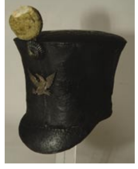
Rare Pattern 1812 Bell Crown Shako Manufactured ca. 1830

Crawford had a record of distinguished service in the U.S. Senate. He had declined the appointment as Secretary of War later offered to Armstrong; but he had maintained a deep interest in the War Department, especially in the General Staff that Congress created in the spring of 1813. Because its purpose was mainly to conduct the housekeeping functions of the Army, it was not a general staff as the term was used a hundred years later but resembled rather the modern special staff. Under it had been placed the Quartermaster, Topographical, Adjutant General, Inspector General, Ordnance, Hospital, Purchasing, and Pay Departments; the Judge Advocates; the Chaplains; the Military Academy; and the commanding generals of the nine military districts and their logistical staffs. Furthermore, by stationing in Washington at the War Department certain officers of the General Staff—the Adjutant and Inspector General (a dual function performed by one officer) with two assistants, the Commissary General of Ordnance with three assistants, the Paymaster of the Army, and the Assistant Topographical Engineer—Congress had provided a management staff for the Secretary of War, who hitherto had only a few clerks to assist him.