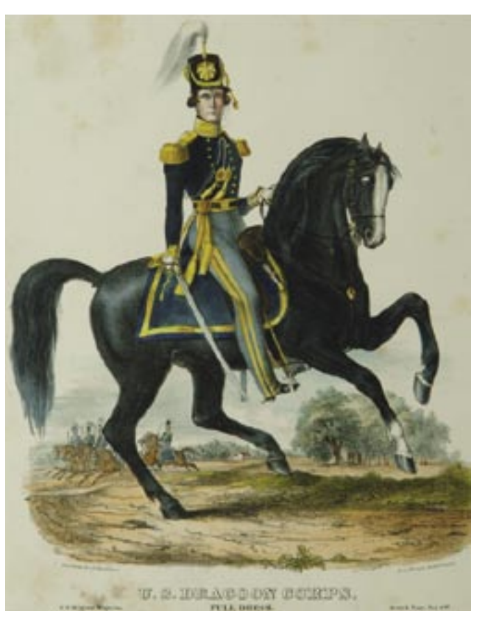
This lithograph shows the full dress of an officer in the Dragoon Corps, ca. 1841.

tlers pouring westward. In 1842, 2d Lt. John C. Fremont of the Corps of Topographical Engineers led an expedition to explore and map the Platte River country for the benefit of emigrants moving over the Oregon Trail; his second expedition in 1843 reached Sacramento in Upper California.