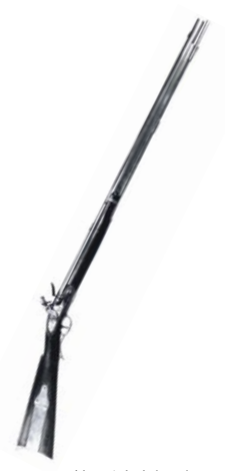
U.S. Model 1816 Flintlock Musket

they settled in the swamps and palmetto forests along with Seminole Indians. The Seminoles were an amalgam of Indian bands mixed with fugitive African American slaves who had migrated from the river valleys of Georgia and Alabama to the protective swamps and pine barrens of Florida. These Indians went unrestrained by weak Spanish officials, shut up in their enclaves at St. Augustine on the east coast, St. Marks in central northern Florida, and Pensacola on the west coast.